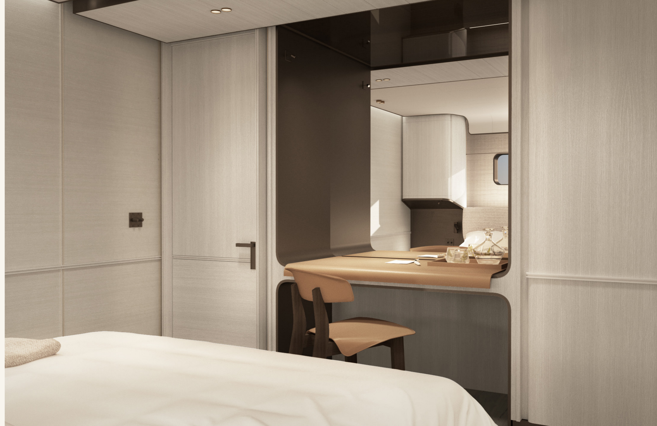
LD Guest Cabin