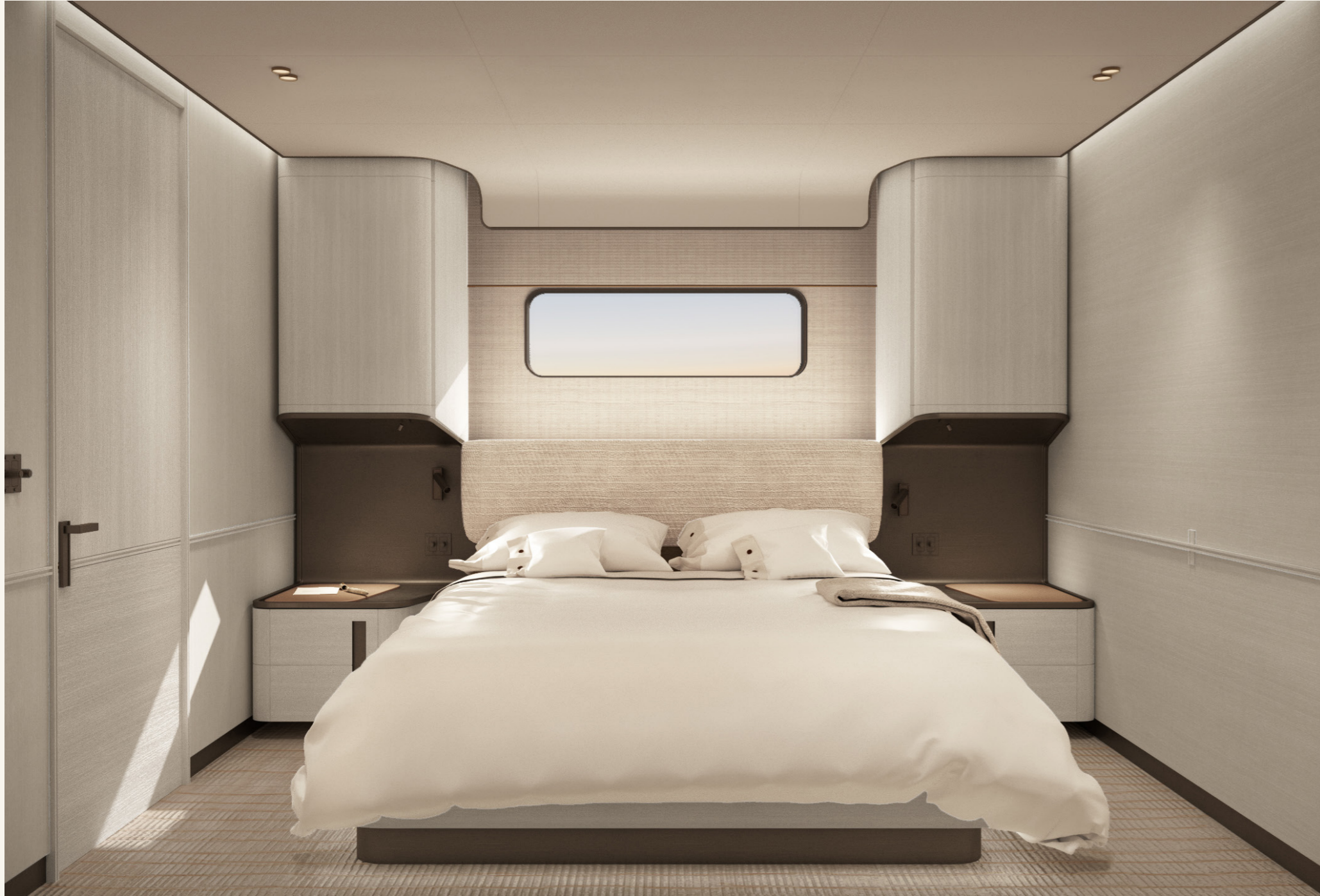
LD Guest Cabin