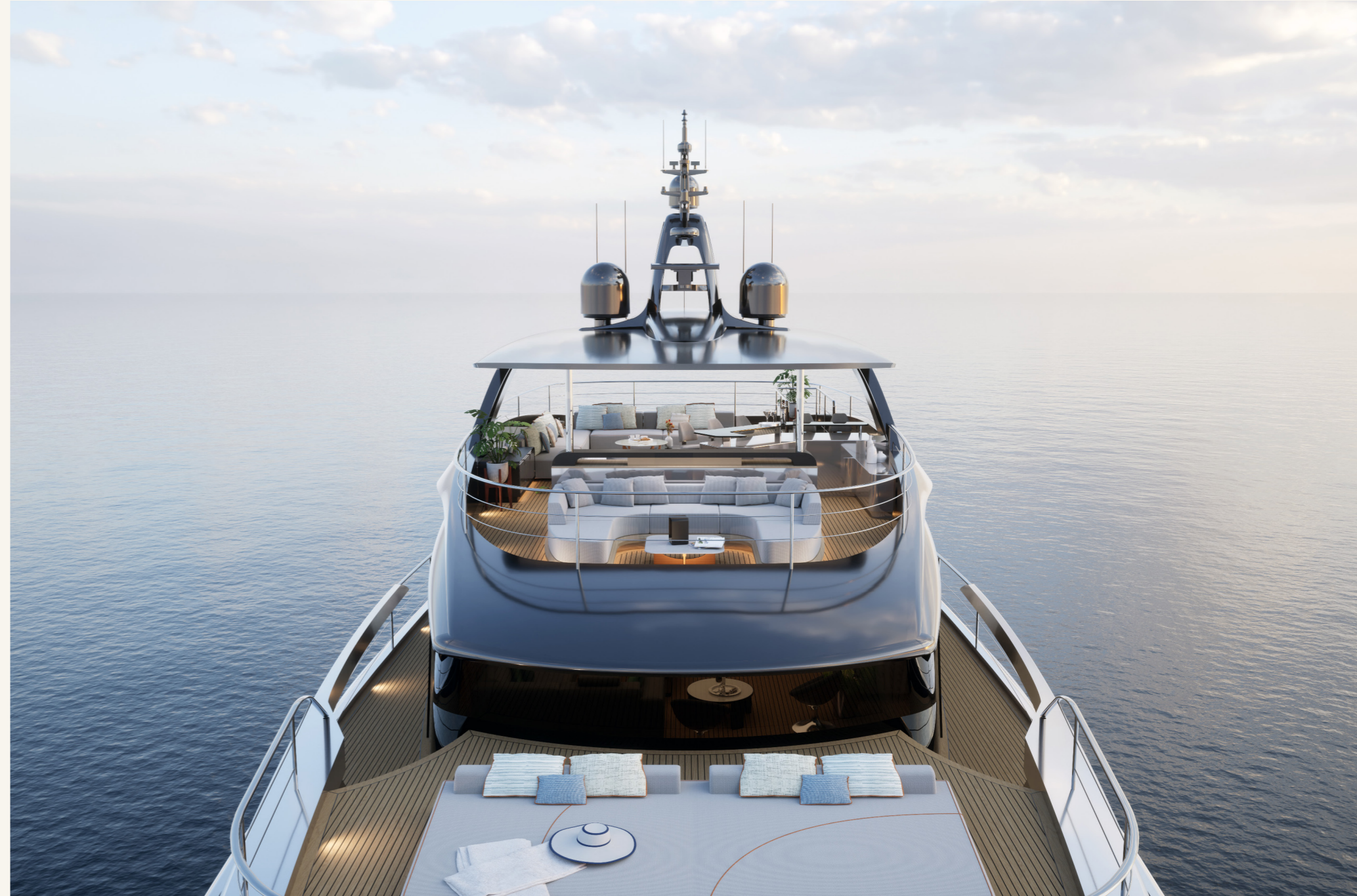
Upper Deck & Sundeck