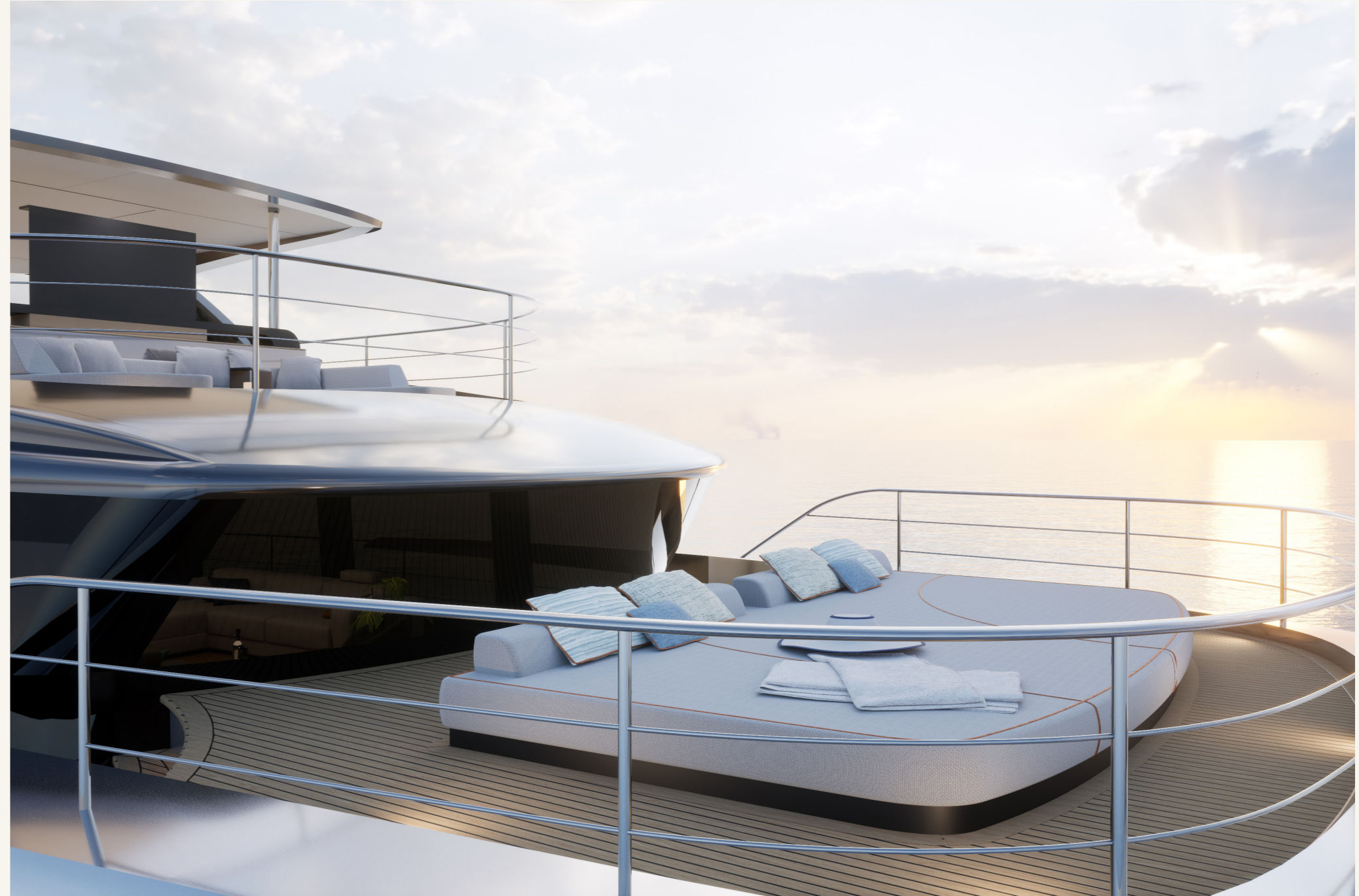
Upper Deck & Sundeck