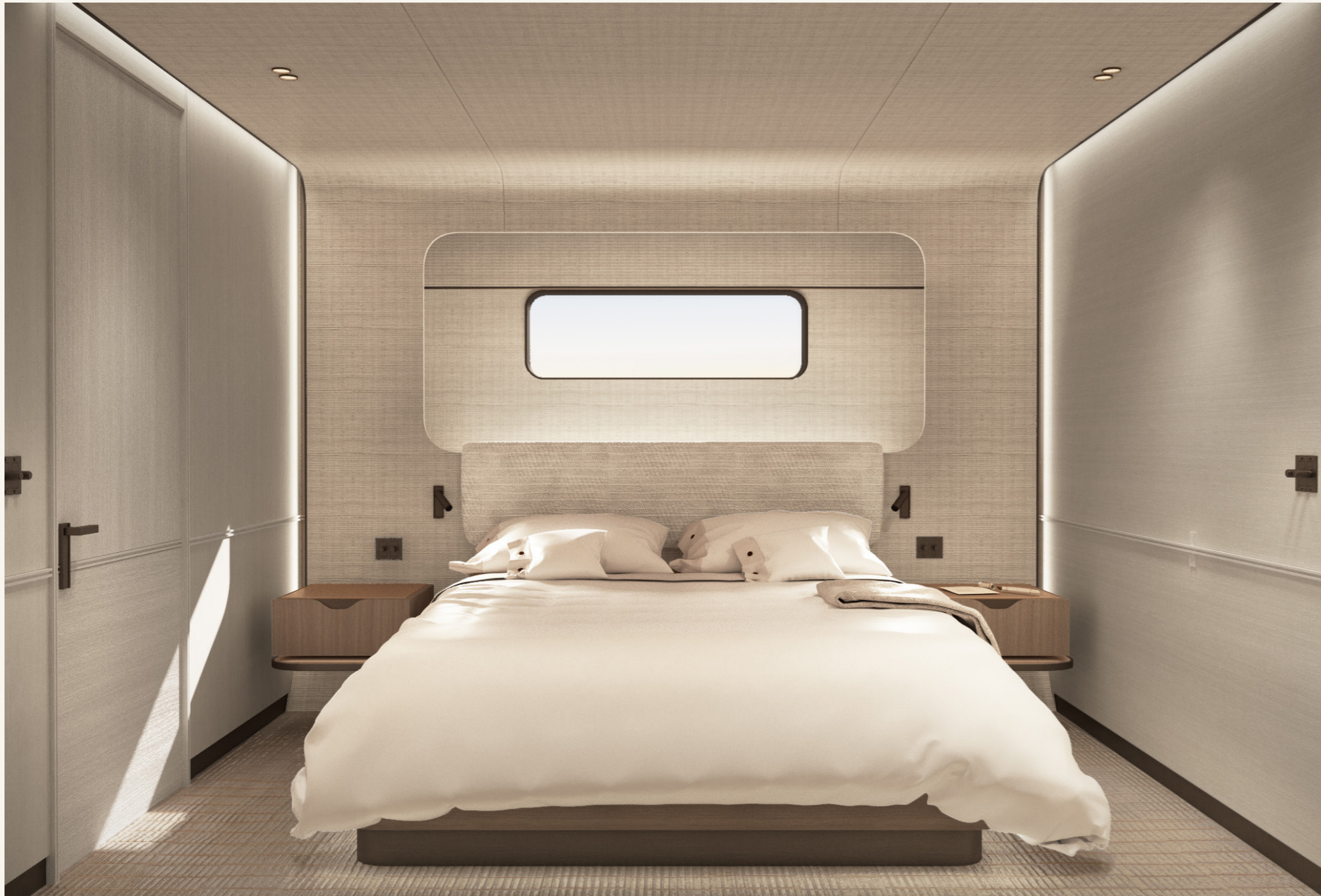
LD Guest Cabin