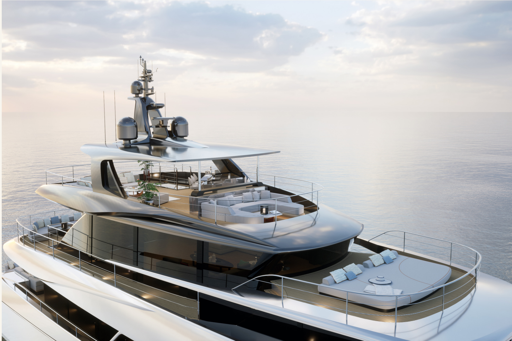
Upper Deck & Sundeck