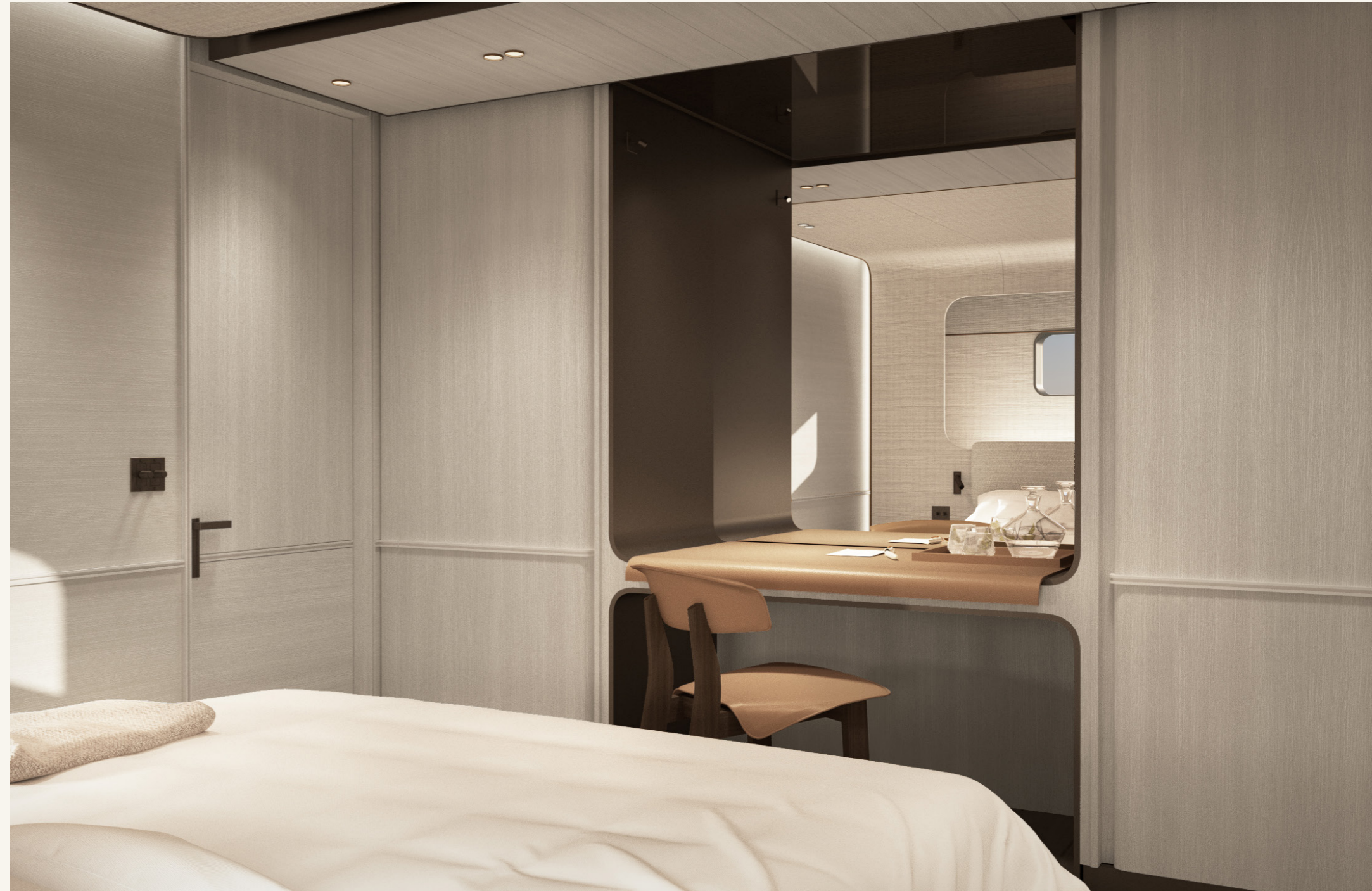
LD Guest Cabin