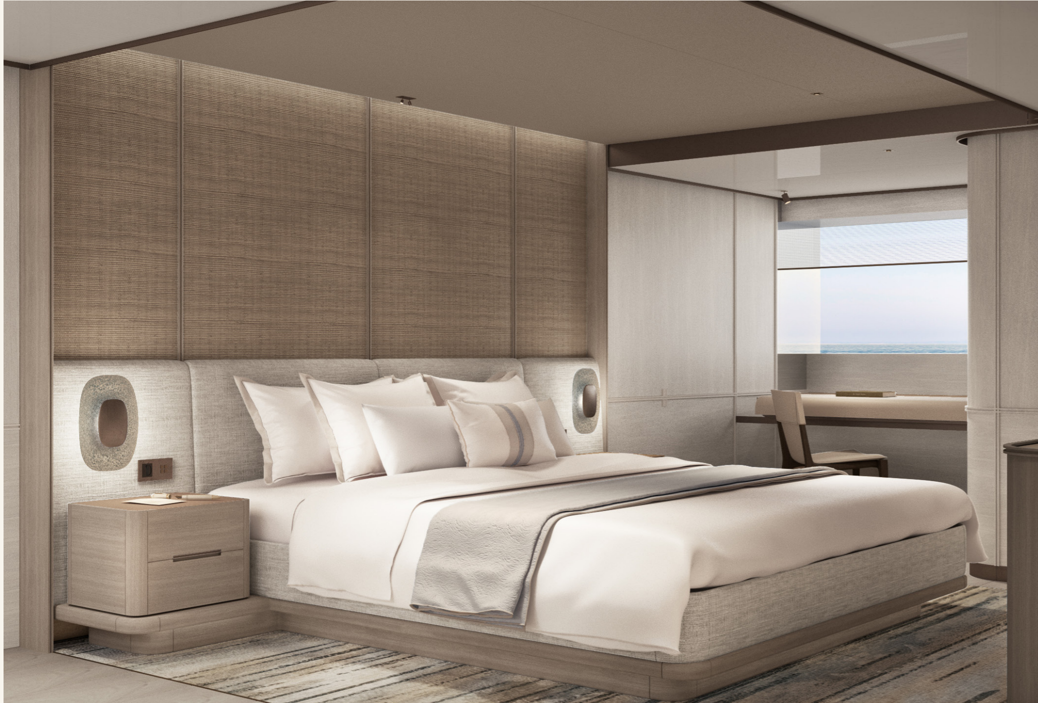
MD Owner Cabin