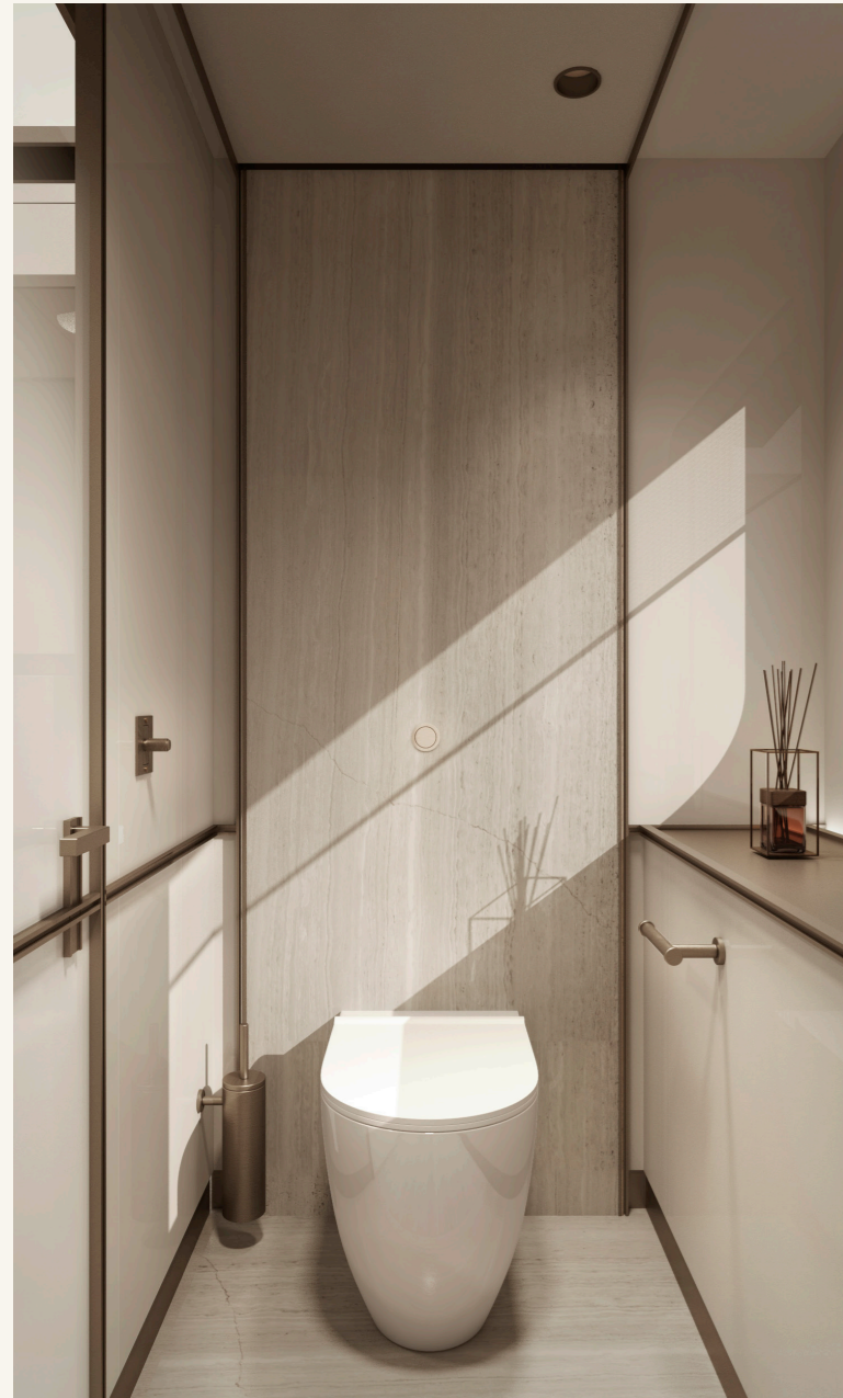
MD Owner Cabin