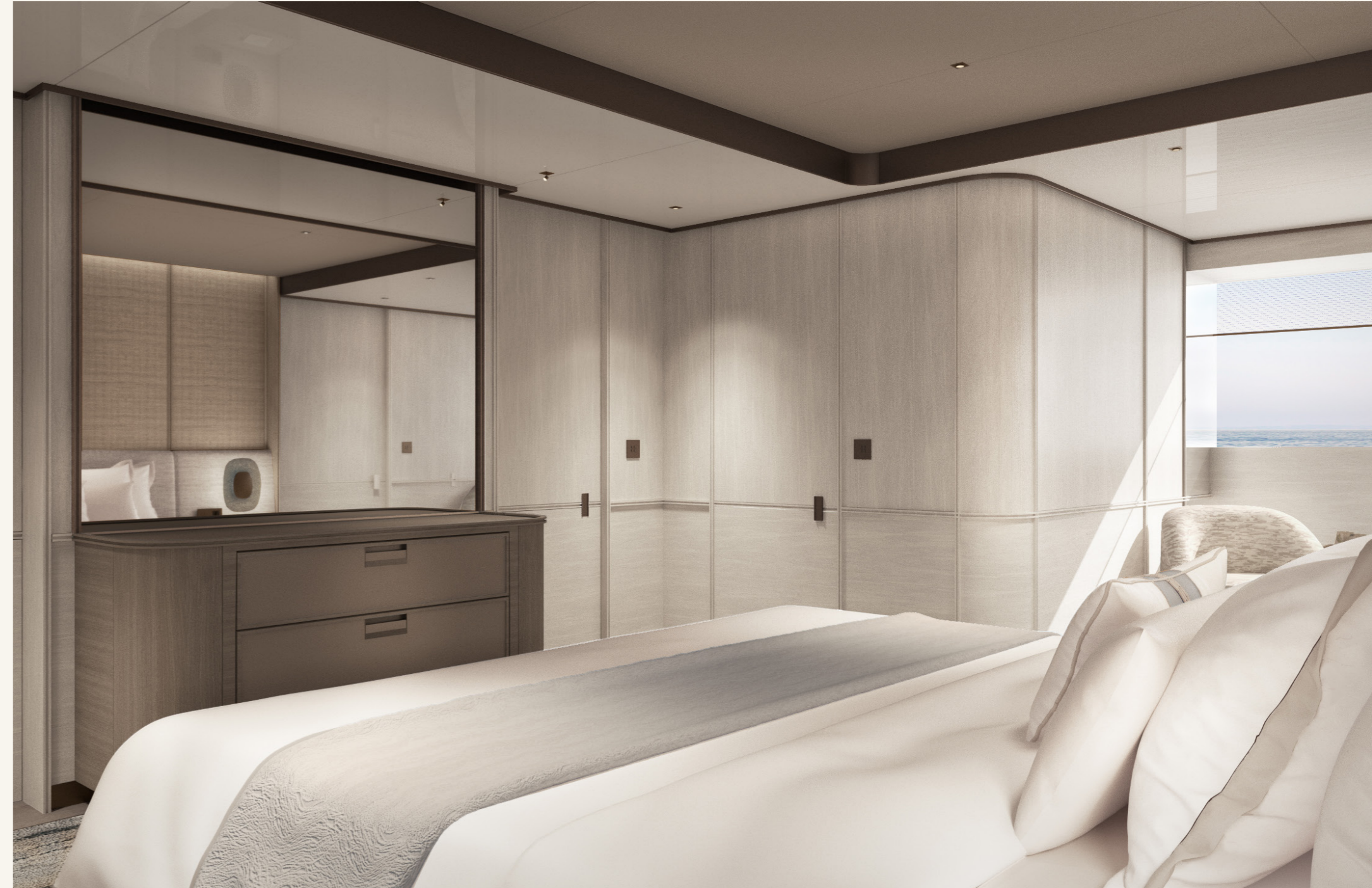
MD Owner Cabin