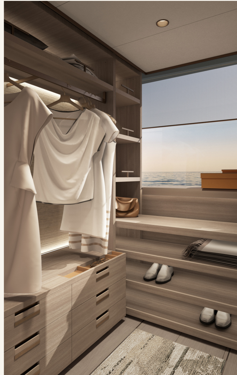
MD Owner Cabin