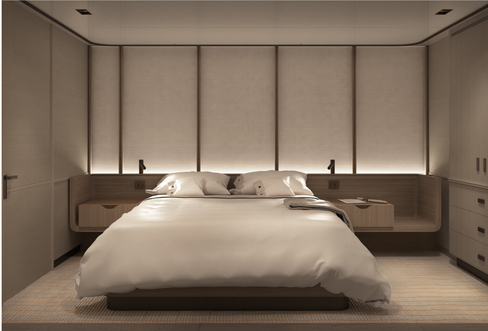
LD Guest Cabin