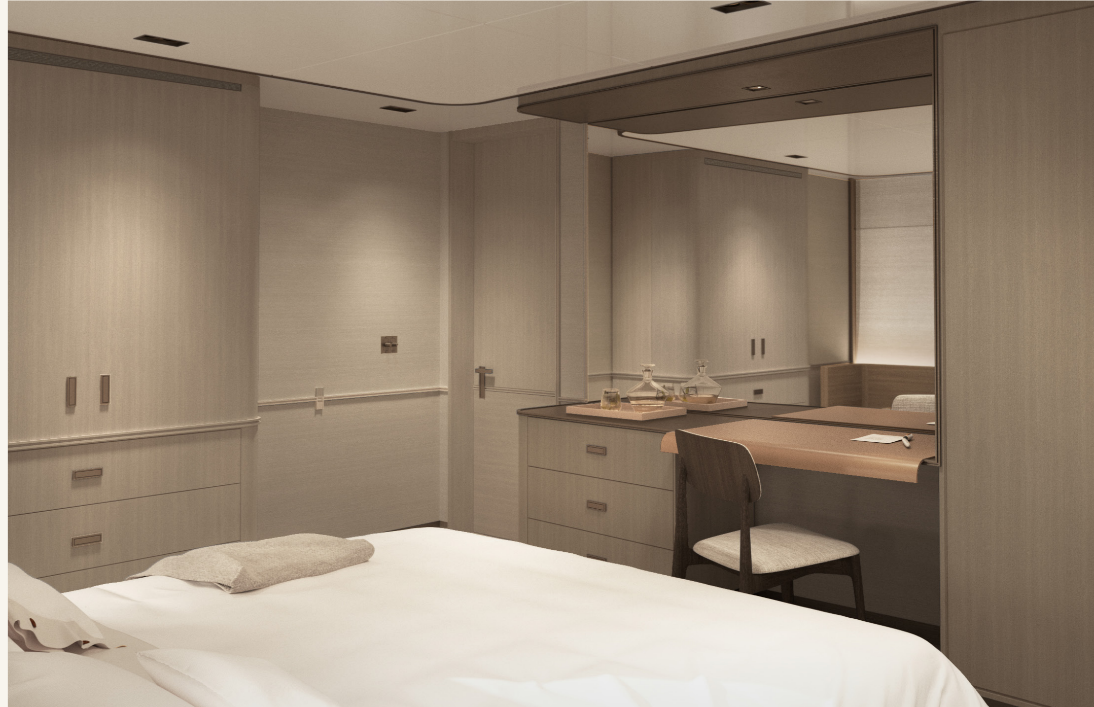
LD Guest Cabin