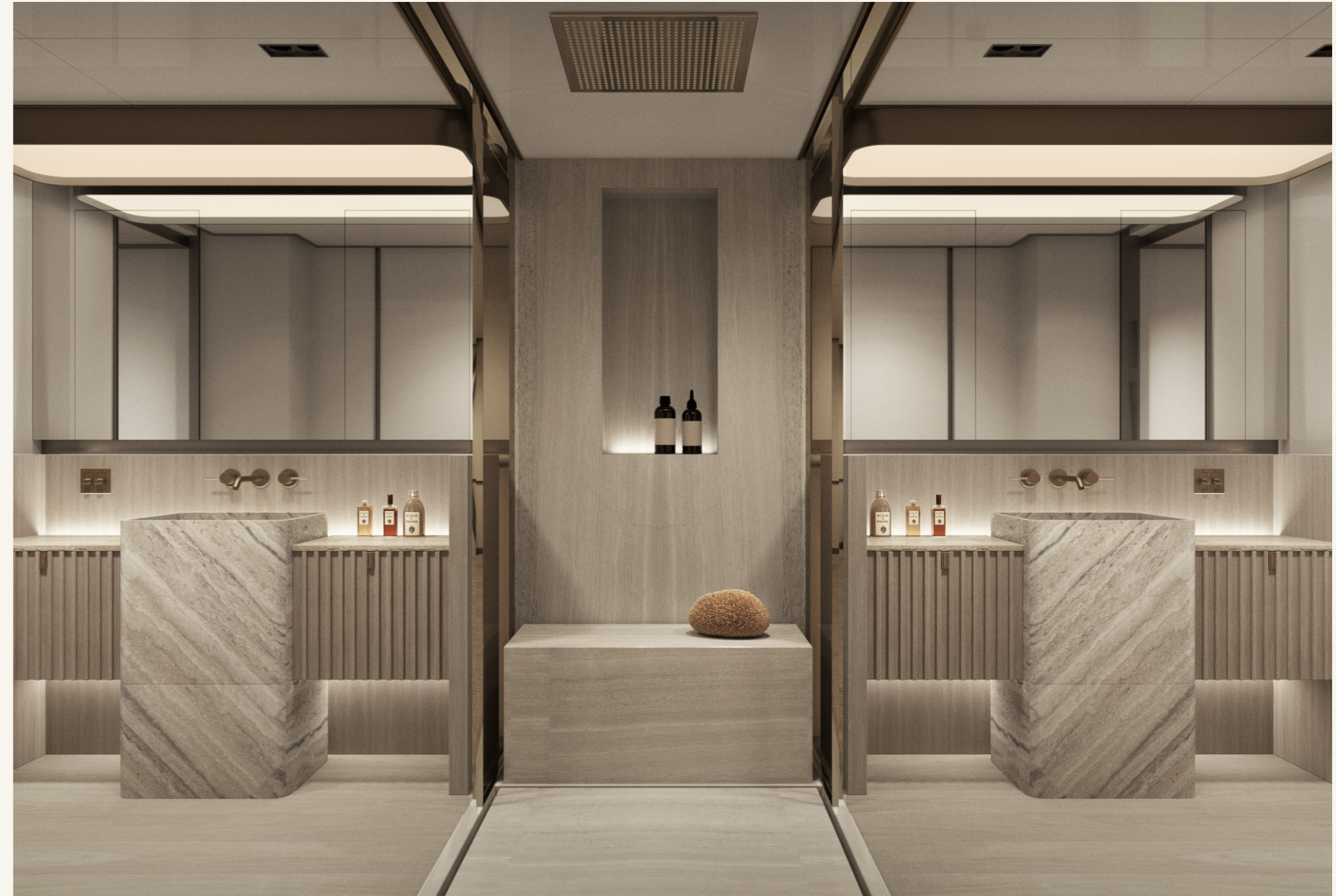
MD Owner Cabin